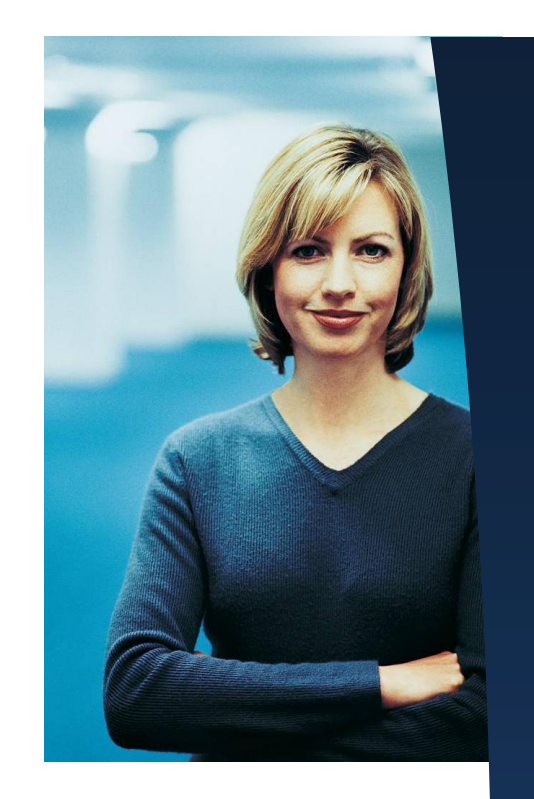
image exchange operations. Teller Capture provides optimum teller efficiency by serving low-volume retail customers at the teller line, as well as high-volume retail and corporate clients at the back counter.

Active Teller Capture moves proof from a central or back office operation to your front office teller. By integrating Teller Capture with your current teller application, your financial institution can capture and balance transactions at the teller window. This enhances your current branch capture and increases efficiency of your